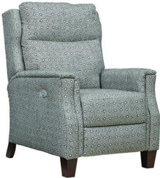
Photo of representative “Wireless Power” reclining chair. Individual models and color may vary.