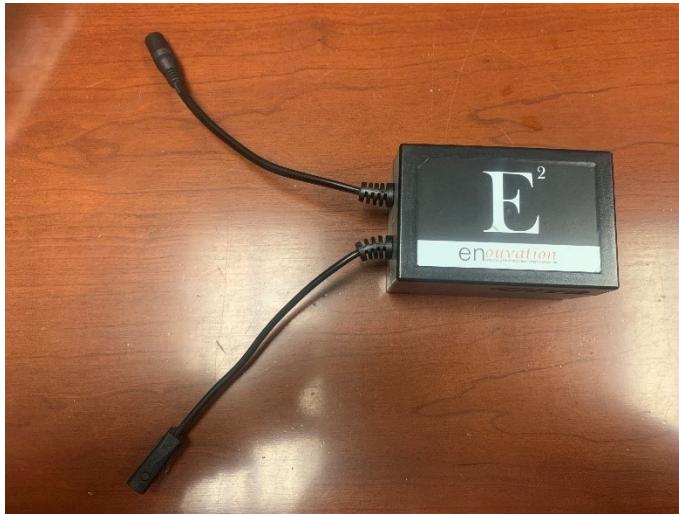
Image of Top of Battery with Label