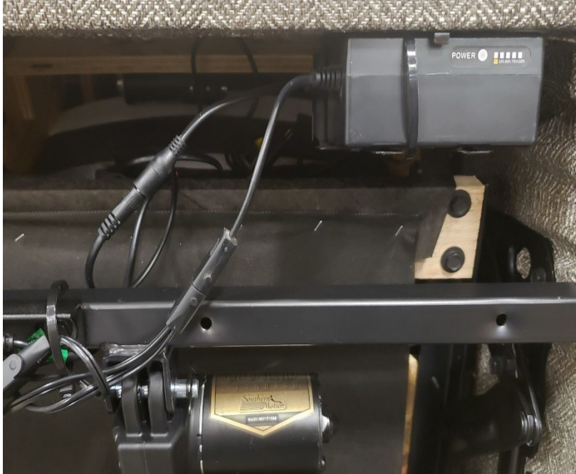
Photo of battery as installed in all Wireless Power furniture