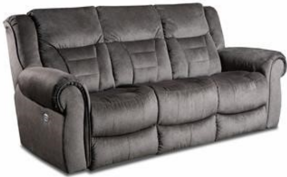
Photo of representative “Wireless Power” reclining sofa. Individual models and color may vary.