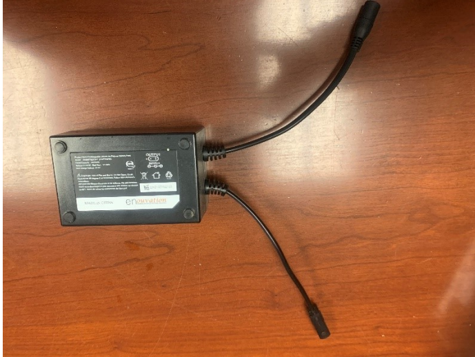
Image of Bottom of Battery with Label